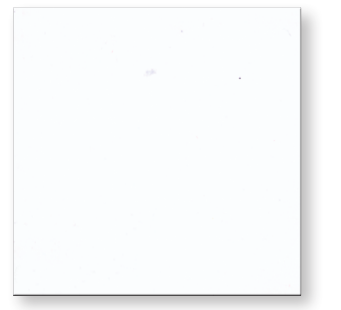
Figure 3 Polyethylene Yellowing Test, One Week.

In many TiO<sub>2</sub> masterbatch formulations or down stream matrices, the TiO<sub>2</sub> is in the presence of other polymer additives. Certain combinations of TiO<sub>2</sub> and additives can cause a discoloration once an appropriate trigger has been released. The most common trigger is ultraviolet irradiation. Ti-Pure<sup>TM</sup> R-350 has demonstrated the ability to resist discoloration in the presence of a sensitive antioxidant/HALS combination. The resistance to discoloration soothes concerns about polymer additive and TiO<sub>2</sub> surface interactions (see Figure 3 ).