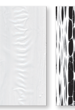
Figure 4 Unmatched Lacing Resistance

At elevated temperatures, most inorganically coated grades of TiO<sub>2</sub> can liberate gases that can create quality issues like holes or other imperfections (particularly in thin films). To overcome this deficiency in the TiO<sub>2</sub>, plastic products are relatively thick, contain less TiO<sub>2</sub> or be produced at less severe conditions. However, in certain end uses, the process must be stressed to the severe conditions to produce the necessary quality product. Ti-Pure<sup>™</sup> R-350 contains a minimum amount of volatile material and has amazing ability to maintain film integrity during stressful processing conditions (see Figure 4 ).