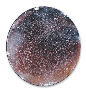
Figure 2 Screenpack Dispersion